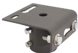
LF-AD-SF Slip Fitter Adapter