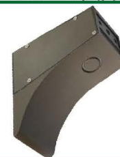
LF5-EXTARM Extension Arm Adapter